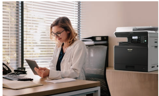
A stylish complement to any office space.

There's no complex set-up or messy cables. An optional wireless LAN lets you connect to any WiFi enabled device, so that anyone can print or scan directly from their smartphone, tablet or PC using AirPrint* 2 , Google Cloud Print or the Sharpdesk Mobile app. Or insert a USB drive and simply select a file from the pop-up menu to directly print any stored documents or save scans to it without having to use a PC.